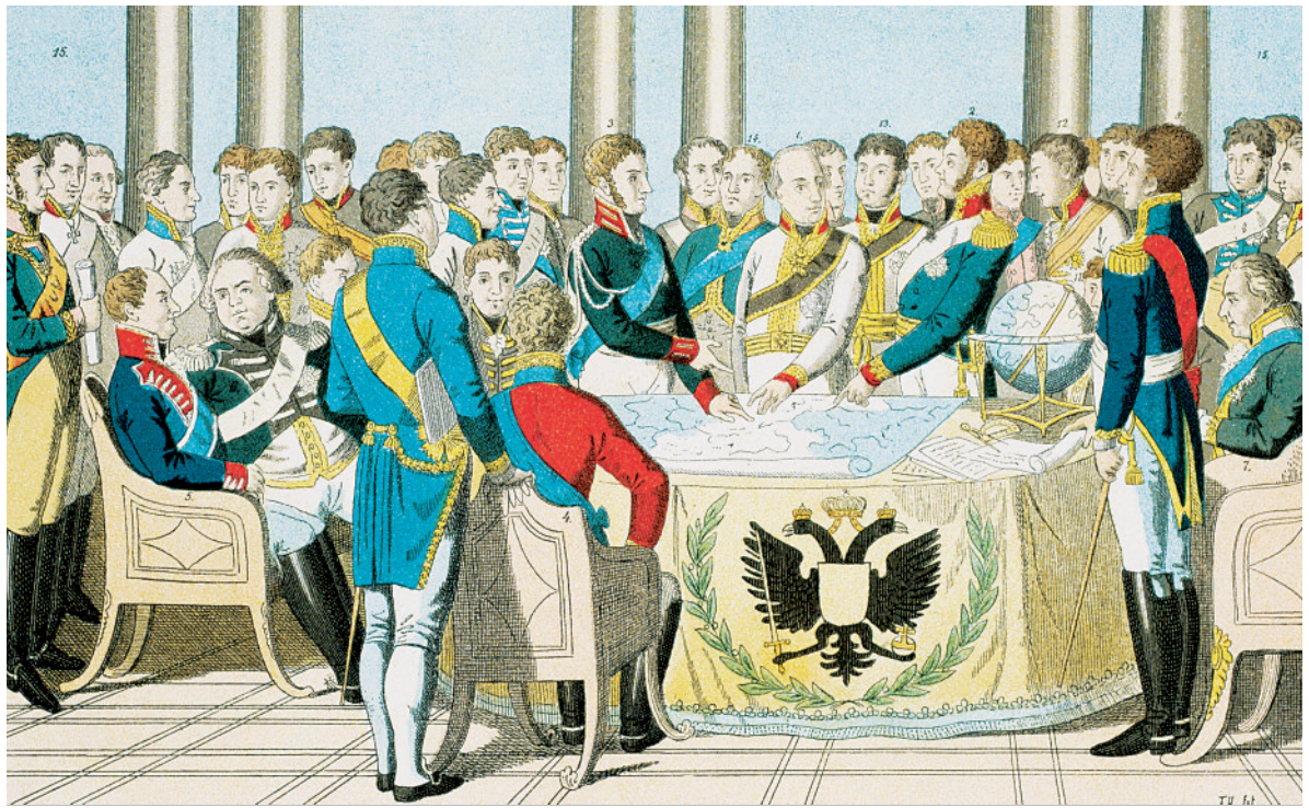
▲ Delegates at the Congress of Vienna study a map of Europe.

These changes enabled the countries of Europe to contain France and prevent it from overpowering weaker nations. (See the map on page 674.)